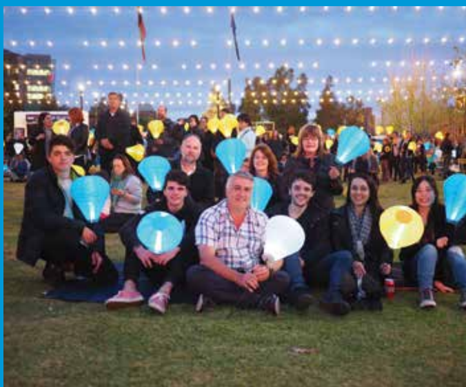
Light the Night Adelaide