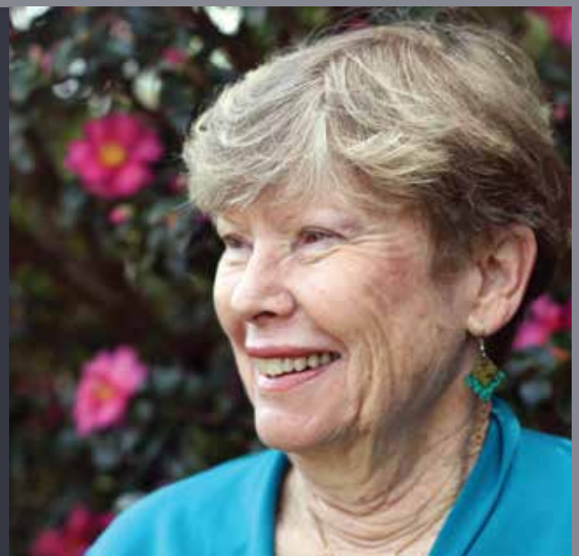
Pam's gift allows us to continue our vital service & research.

► If you would like to discuss leaving a gift in your Will, please contact Emma Quigley on 0407 176 487 or email equigley@leukaemia.org.au