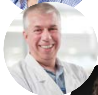
Image 3: Dr Charles Mullighan, at St Judes Children's Research Hospital in Memphis USA, is harnessing a new type of therapeutic called a PROTAC which will be tested in combination with existing therapies in treating high risk ALL patients.