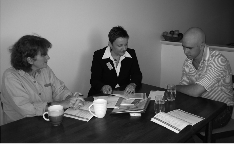
"Foundation staff provide patients and their families with information and support across Australia"

The Leukaemia Foundation has a team of highly trained and caring Support Services staff with qualifications in nursing or allied health that work across the country. They can offer individual support and care to you and your family when it is needed.